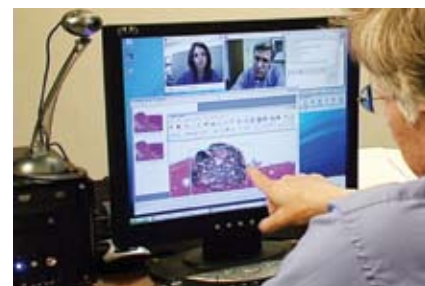
Live collaboration with voice, video and microscopic images